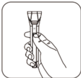
Long press the button