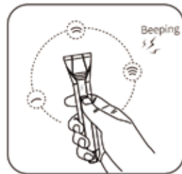
Three level adjustable