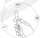
Three adjustable levels