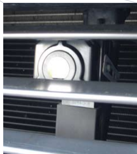
The FLIR Systems PathFindIR installed behind the vehicle grid of a Porsche Cayenne

"Now that it is installed, I use the PathFindIR a lot", continues Xavier. "It allows me to see further than