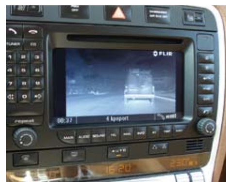
The thermal images generated by the PathFindIR can be displayed on any multi-function LCD display that accepts composite video. In this case on an LCD integrated in the Porsche dashboard.